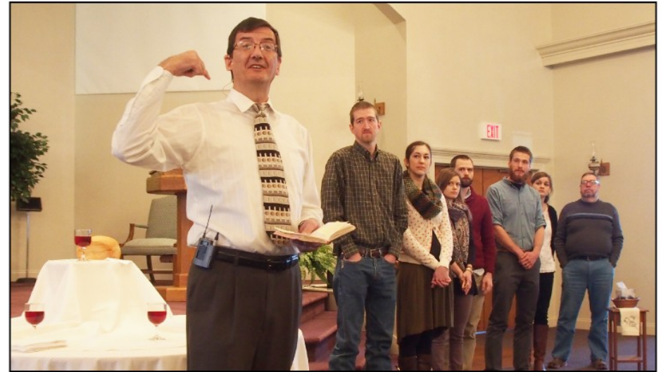
Above: Dedicating our three new elders last Sunday. Below: Participating in Ministry Stations.