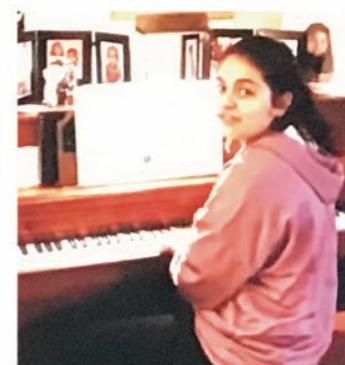
Photos of Conestoga zooming and worshipping together on-line.