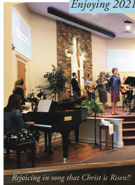
Enjoying 2021 Easter Weekend!