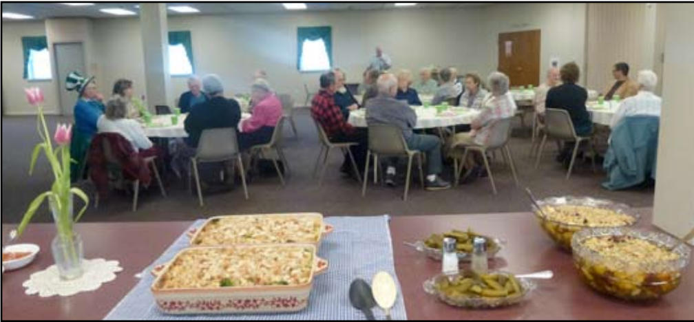
Gathering at the March Senior Connections as the food awaits in the foreground.