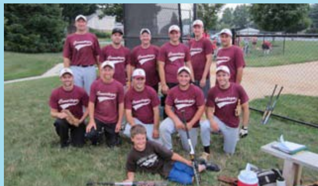
Last year's Conestoga Softball Team.

It is soon Softball Season again! A sign-up sheet is in the lobby to sign up to play on Conestoga's Softball Team!