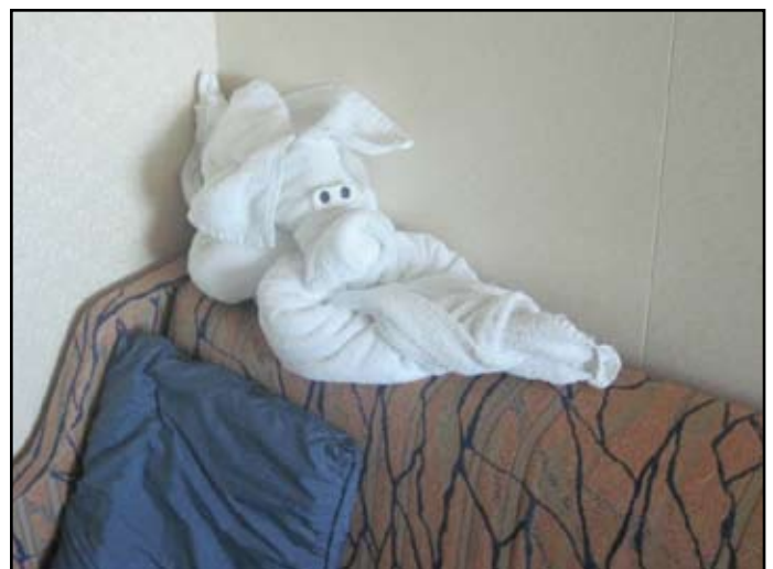
Left: The Gaither Vocal Band who performed on our cruise ship. Right: Cruise ship staff made our towel in the form of a dog!