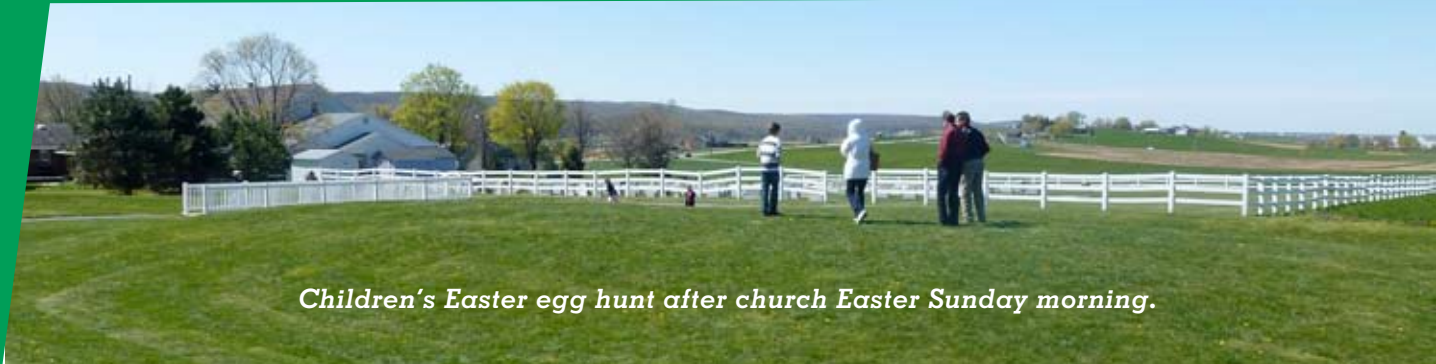
Children's Easter egg hunt after church Easter Sunday morning.