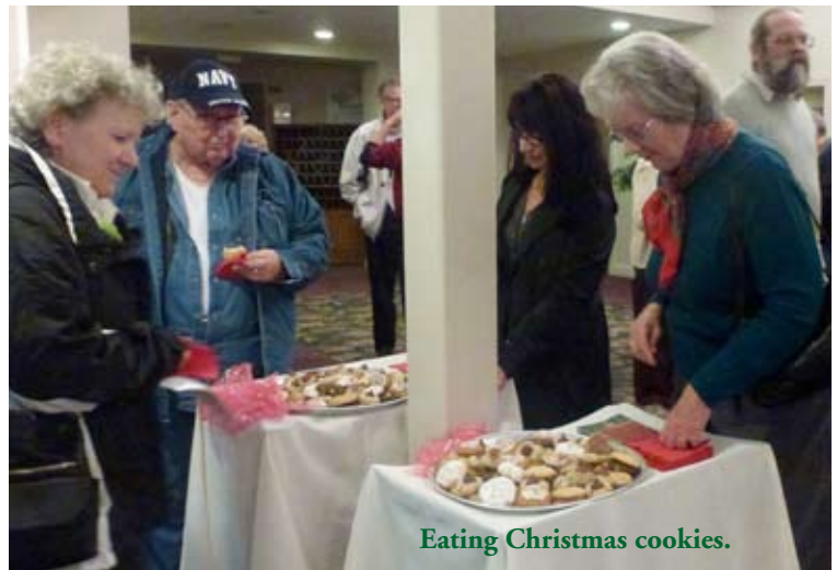
Eating Christmas cookies.