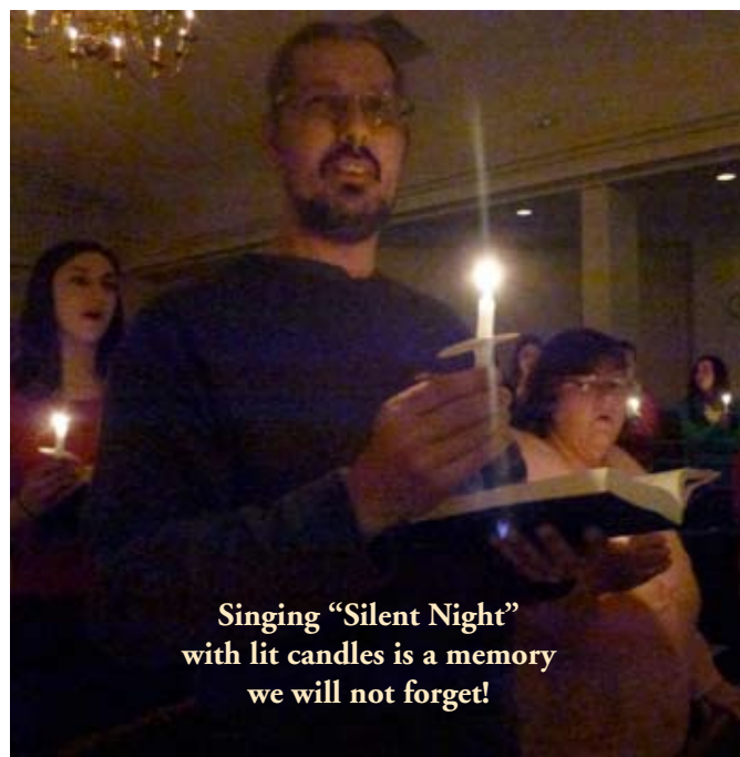
Singing "Silent Night" with lit candles is a memory we will not forget!